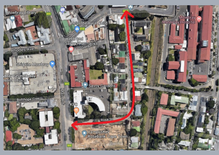
Aerial view of Church Street and surrounding area