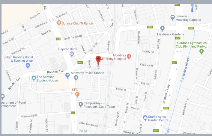
Map view of location of Church Street