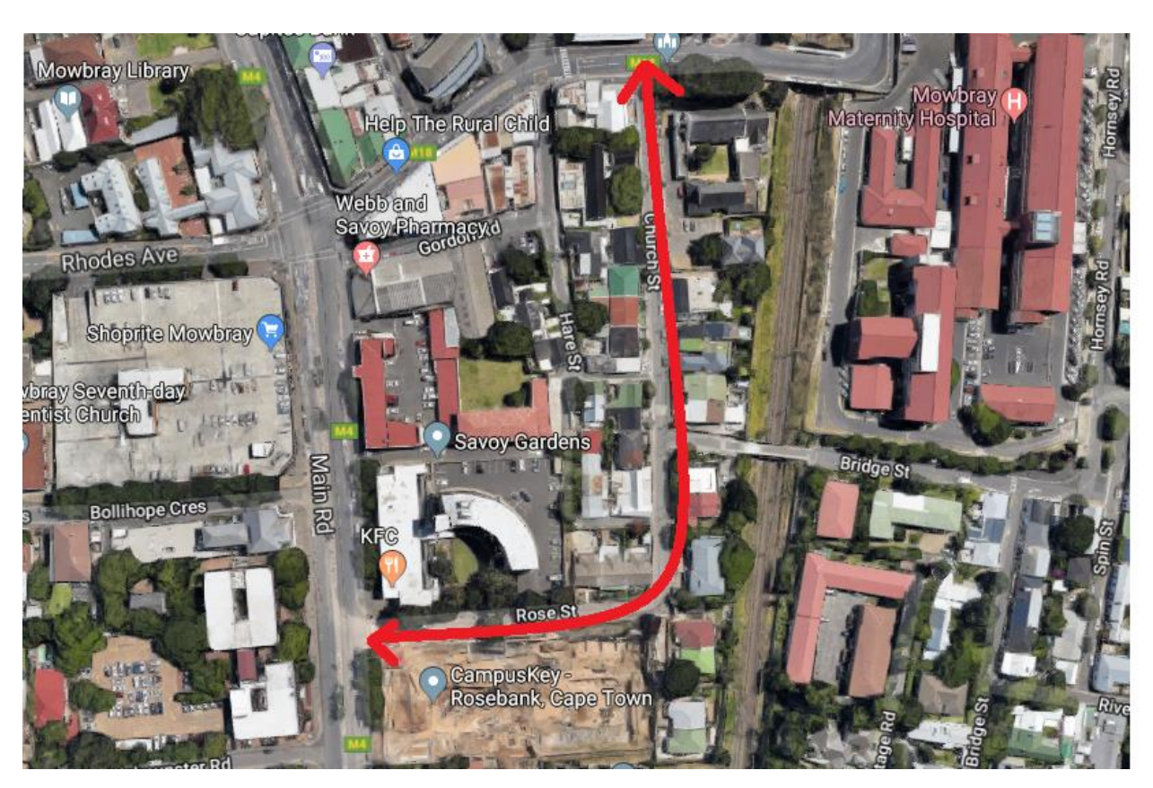
Diagram 1: The diagram above illustrates the movement of traffic through Church Street when motorists use the street as a slip road to avoid traffic congestion in the main road

Members of the Mowbray community, more specifically the members who reside in close proximity to Church and Bridge Street have expressed concern at the deterioration and lack of upkeep of the streets. This has led to an increase in unwanted street traffic and potential hotspot for criminal activities, as well as further deterioration of the street.